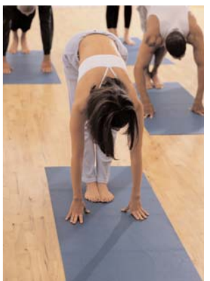
Therapeutic exercise may help in the treatment of scoliosis.

mild scolioses do not progress and cause few, if any, physical problems. Bracing is generally reserved for children who have not reached skeletal maturity (the time when the skeleton stops growing), and who have curves between 25 and 45 degrees. Surgery is generally used in the few cases where the curves are greater than 45 degrees and progressive, and/or when the scoliosis may affect the function of the